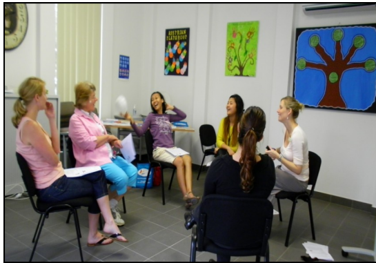
We are very happy to be making full use of our newly renovated Education Room here at Linking Families